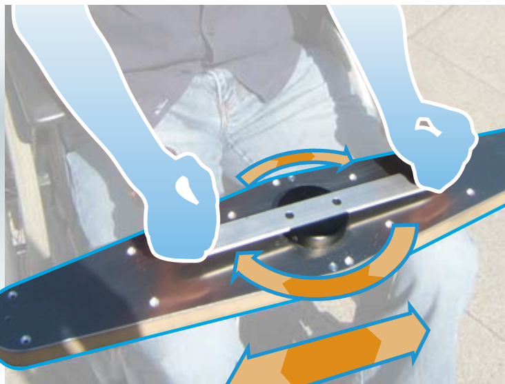
The easy to use rotational movement works the adductor muscle group.

The LARA is the first of many products designed and developed by the co-directors of this new and innovative company.